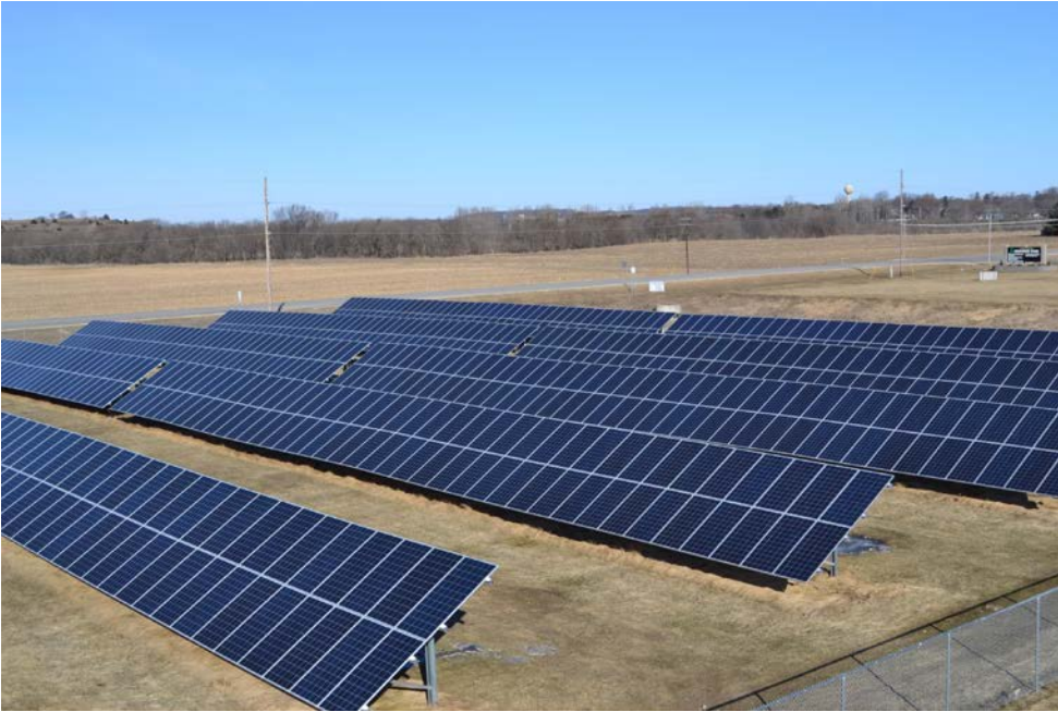
People's Energy Cooperative's 256 KW Community Solar Elgin, MN