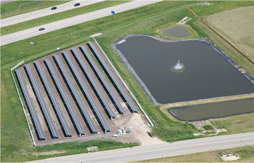
Minnesota Three's 517 kW Solar Facility Oronoco, MN